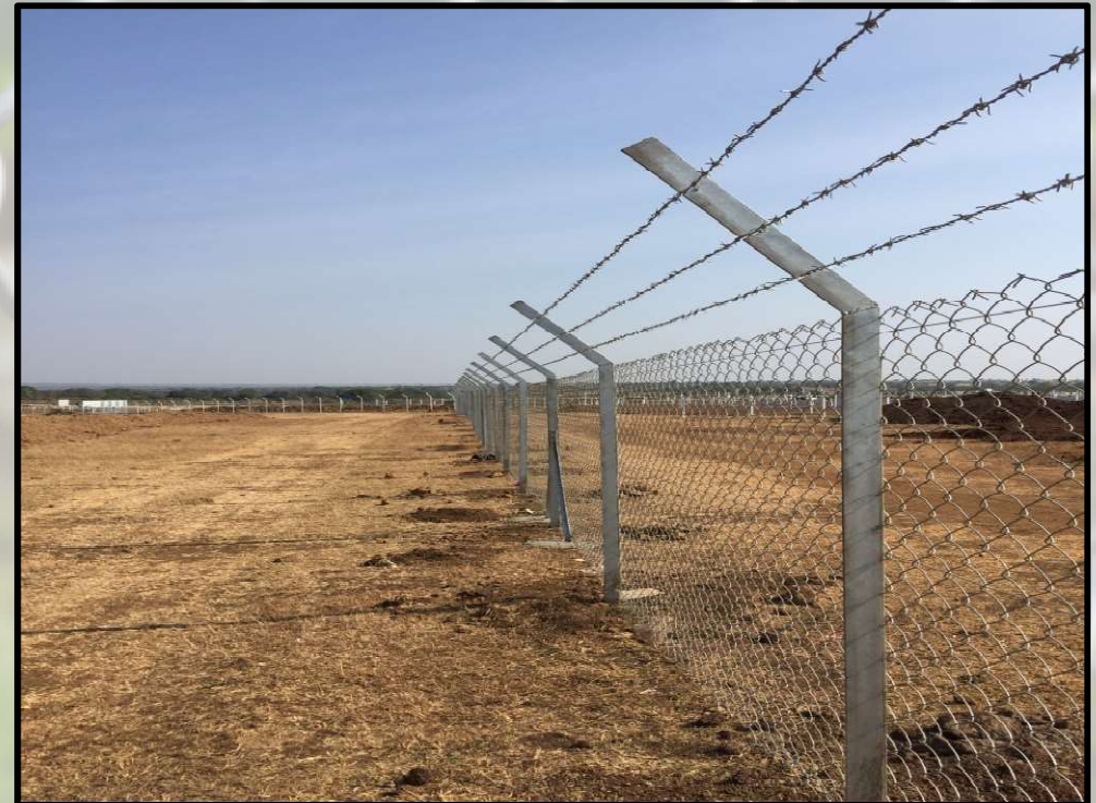
CHAKRA solar power plant fence