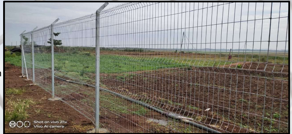
CHAKRA 8 feet anti-theft fence

Less spoken and least chosen but never forgotten, we have in our range of production barbed wire of 120&275GSM lasting to its versatile reasons. Updated and along line with technology and market pulse, we have an installed capacity of manufacturing 1000 kilograms of barbed wire per day.