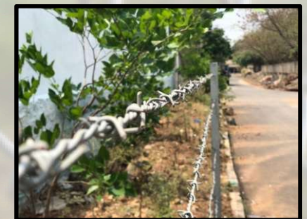
CHAKRA 12x12g, 275GSM barbed wire