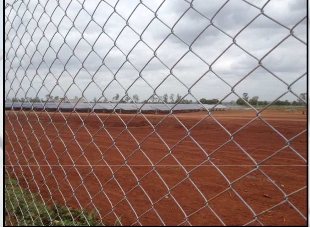
CHAKRA 2.5" 10g 275GSM chain link

Fencing posts can either be iron angles or round posts of a certain standard which are provided with provisions to hold the wire mesh. These fencing posts have to be dug into the ground to a specific depth or reinforced into a wall to a mentioned depth to hold on straight. An inclined position is always an option available open. We are very stern on the fencing posts being as strong as to tolerate any kind of destructions. Fencing posts will vary for different kinds of chain link firmed to them. A thicker wire chain link will have to be provided with higher strength fence post. A thinner or less height chain link enabled just to guard animals and other stray animals can be provided with a lower strength of fence posts.