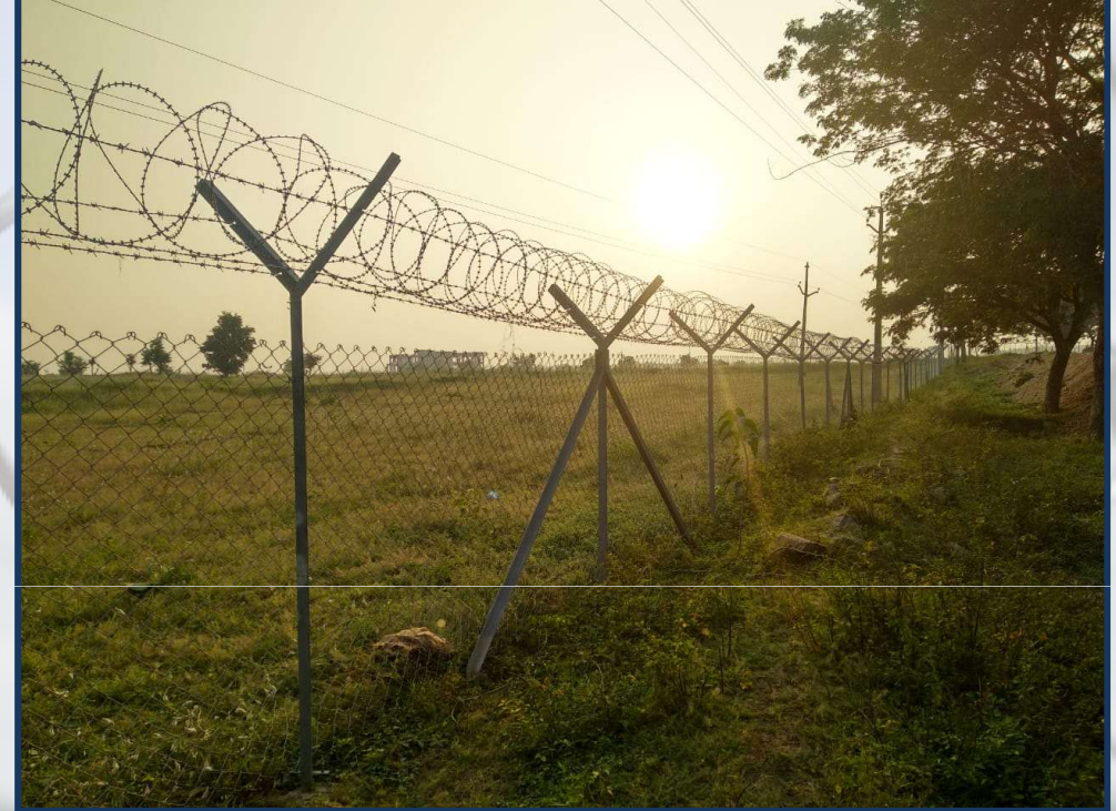
CHAKRA high security fence

Alerted with the advancements in the market and products, we have also in our product range the welded mesh fencing adding a bundle of advantages to the fencing category.